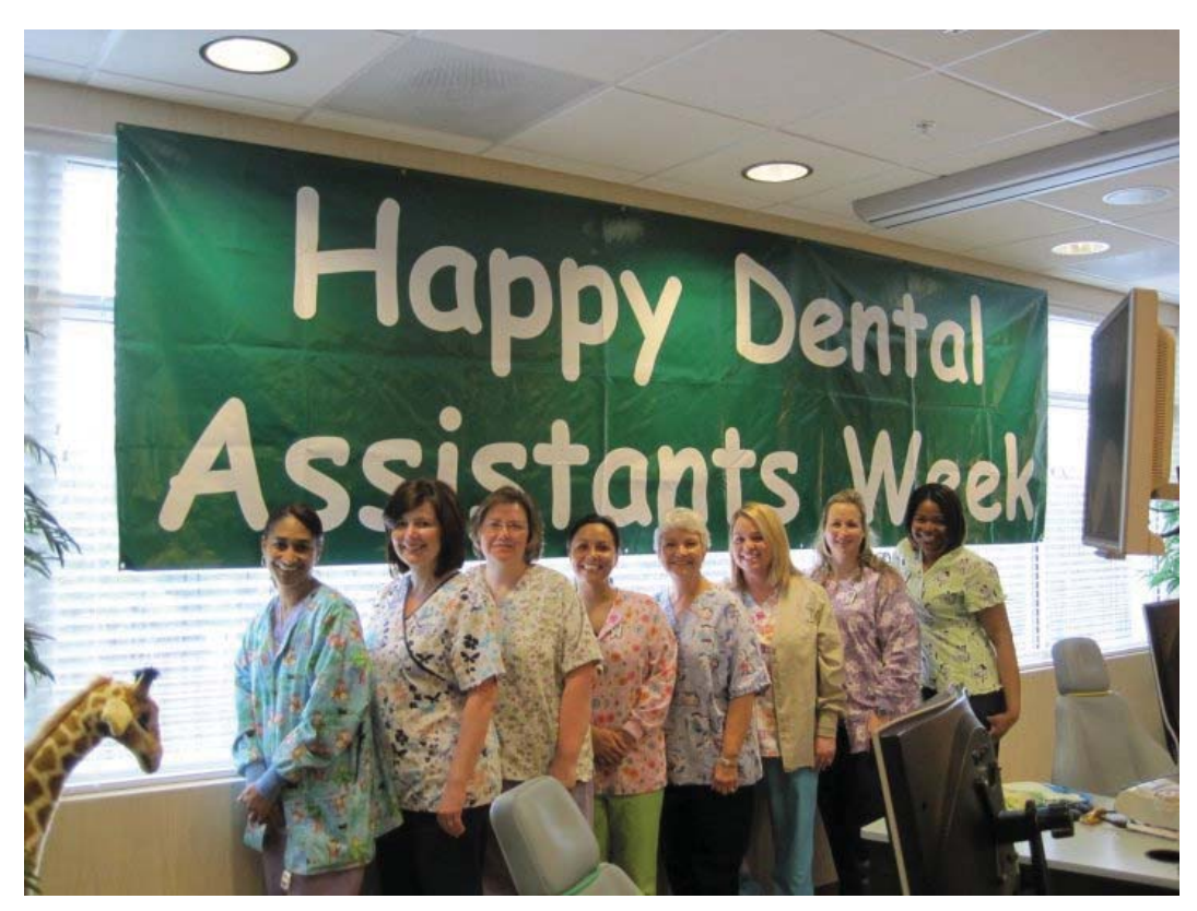
We all went out to eat together as an office for lunch as well as providing the DA's gift cards.